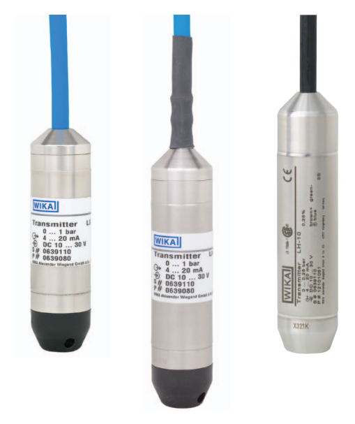
Fig. left: Submersible pressure transmitter model LS-10 Fig. centre: Submersible pressure transmitter model LH-10 Fig. right: Submersible pressure transmitter model LH-10 in Hastelloy