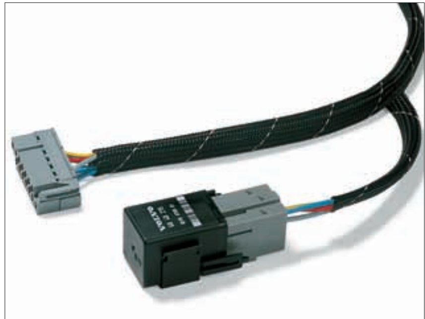
Helagain HEGPV0X braided sleeving.

To prevent fraying, the sleeve is cut with a hot-knife, which melts and cleanly fuses the ends of the yarn. For more information on HSG0 hot-knife please turn to Chapter 6.3.