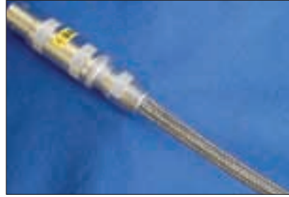
EMI braided sleeving: reliable protection from electromagnetic radiation.