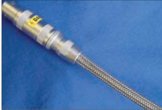
Helagain HEGEMIP braided sleeving is made of tin-plated copper and polyester yarn.

Made of tin-plated copper and polyester threads, Helagain HEGEMIP and HEGEMIPVO braided sleeves offer electromagnetic protection as well as secure cable bundling. The mix of materials makes the sleeves expandable and easy to apply. In contrast to purely copper braids, the HEGEMIP and HEGEMIPVO sleeves can be bent and twisted and still return to their original form. As a result, HEGEMIP and HEGEMIPVO are particularly suitable for applications where there is movement.