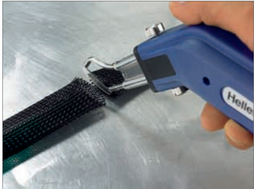
The HSGO hot cutting tool prevents the braided sleeving from fraying.

The HSGO hot cutting tool is a light, robust, hand-held device to cut synthetic fabrics such as braided sleeving. It heats up quickly with the press of a button and cuts the sleeving cleanly in a matter of seconds. The individual strands melt and fuse together, preventing the sleeving from fraying.