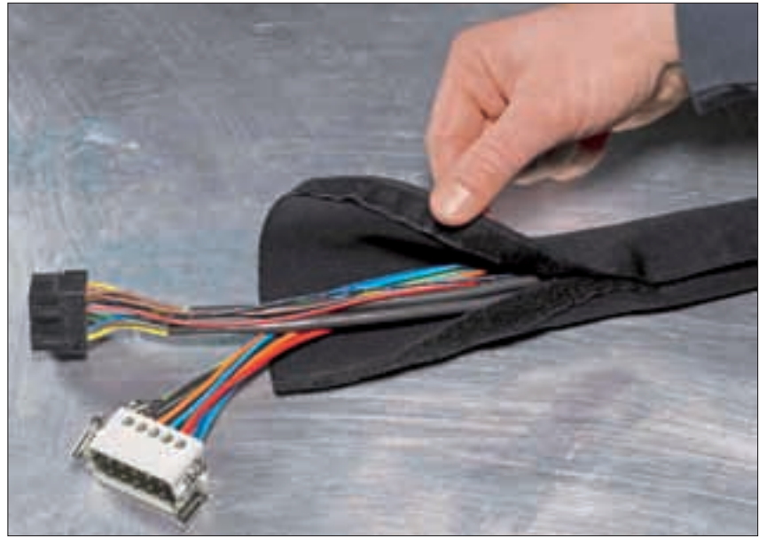
HELAHOOK protective sleeving allows for retrospective fitting and repeated use.

HELAHOOK is used in industrial machines, electrical appliances, shipbuilding, railway vehicles and in the aerospace industry. HELAHOOK is also employed in automobiles or commercial vehicles. It is the ideal solution for post-termination cable organisation and wherever repeated use is a necessity.