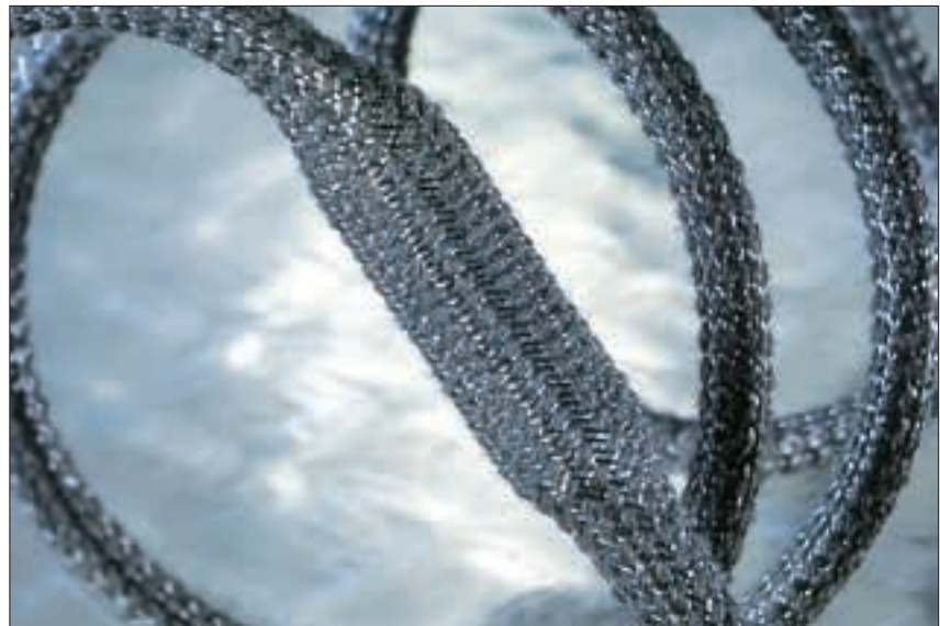
With its special yarn structure, Helagain HEGSAS is very effective in reducing vibration noise.

Helagain HEGSAS is used primarily in the automotive sector and wherever vibration noise must be reduced. Helagain HEGSAS can be supplied in pre-cut lengths on request.