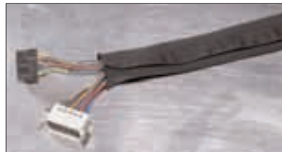
HELAHOOK provides excellent abrasion resistance.