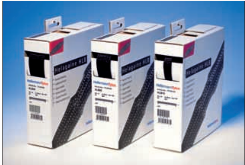
Helagaine HLB: The expansion rate makes it possible. Only three sizes in a handy dispenser box for almost all standard diameters.

The fraying of the sleeving can be prevented with the HSG0 hot cutting tool. You can find more information on the HSG0 hot cutting tool in chapter 6.3