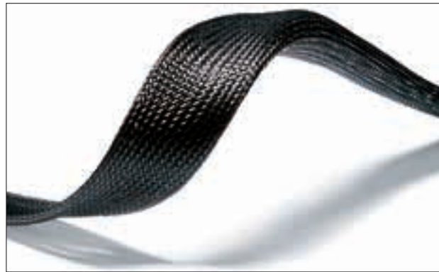
Helagaine HEGPX braided sleeving.