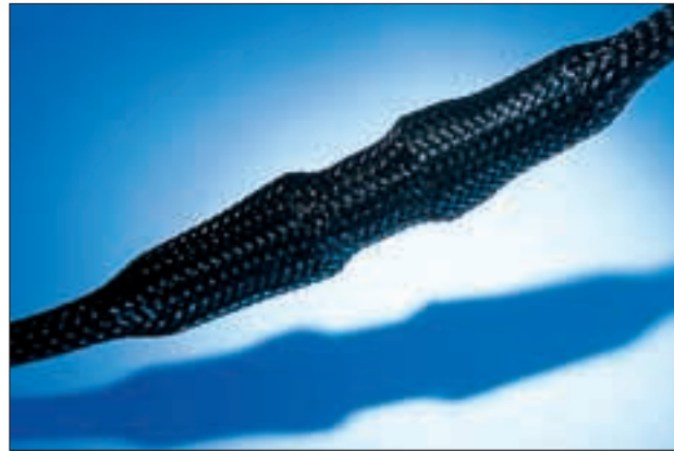
Helagaine HEGP braided sleeving.

To prevent fraying, the sleeve is cut with a hot-knife, which melts and cleanly fuses the ends of the yarn. For more information on HSG0 hot-knife please turn to Chapter 6.3.