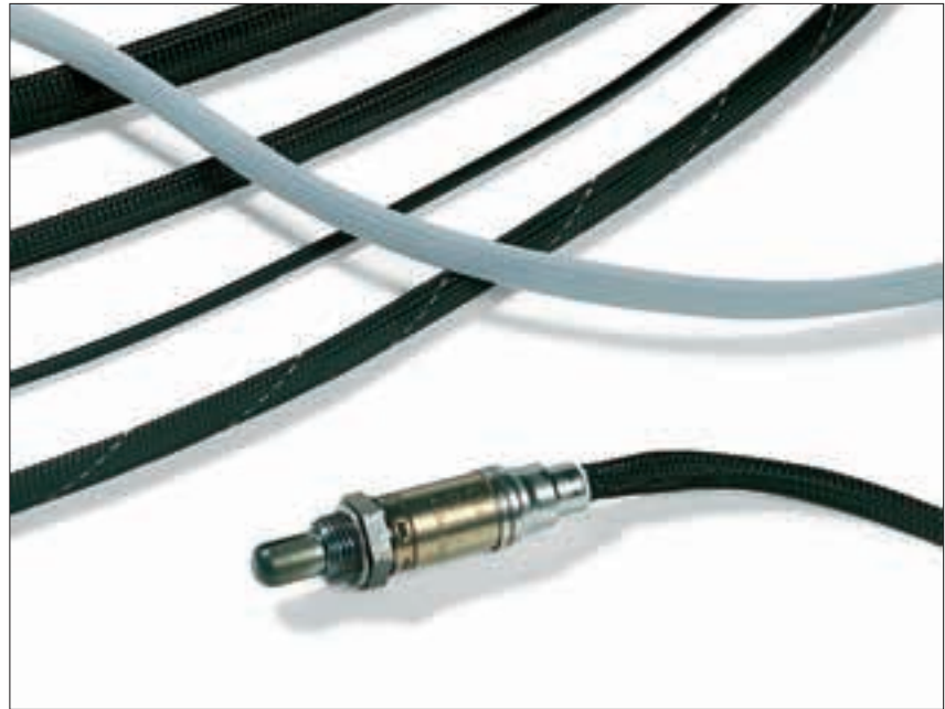
Various types of Helagain braided sleeving.

Fraying of the braided sleeving can be avoided by using a hot-knife to cut the sleeving. Braided sleeving can also be supplied in pre-cut lengths on request.