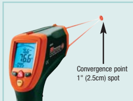
Two laser points converge at a distance of 50"/127cm ) and form a 1" (2.5cm) spot.