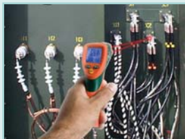
Fast response captures hot spots