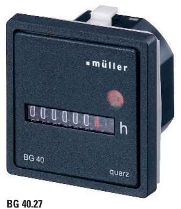
Front panel with trim 55 x 55 mm