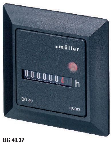
Front panel with trim 72 x 72 mm