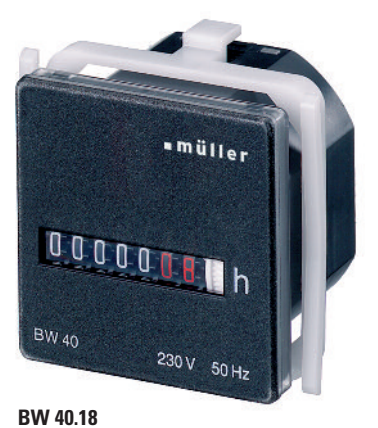
Front panel 48 x 48 mm