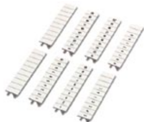
Zack marker strip, 10-section, horizontally labeled with the consecutive numbers: 51 ... 60, white, Width: 5 mm

Please be informed that the data shown in this PDF Document is generated from our Online Catalog. Please find the complete data in the user's documentation. Our General Terms of Use for Downloads are valid ( http://phoenixcontact.com/download )