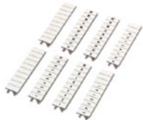
Zack marker strip, 10-section, horizontally labeled with the consecutive numbers: 41 ... 50, white, Width: 5 mm

Please be informed that the data shown in this PDF Document is generated from our Online Catalog. Please find the complete data in the user's documentation. Our General Terms of Use for Downloads are valid ( http://phoenixcontact.com/download )