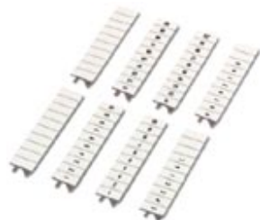
Zack marker strip, 10-section, horizontally labeled with the consecutive numbers: 31 ... 40, white, Width: 5 mm

Please be informed that the data shown in this PDF Document is generated from our Online Catalog. Please find the complete data in the user's documentation. Our General Terms of Use for Downloads are valid ( http://phoenixcontact.com/download )