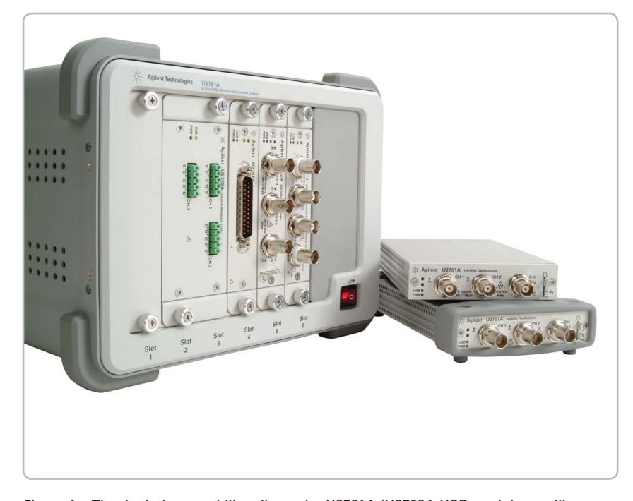
Figure 1. The dual-play capability allows the U2701A/U2702A USB modular oscilloscope to be used as a standalone unit or as part of test system in a cardcage.

The U2701A/U2702A USB modular oscilloscopes are equipped with High-Speed USB 2.0 interface for easy setup and plug-and-play. This ease of use makes the oscilloscopes ideal for the education, design validation and manufacturing industries.