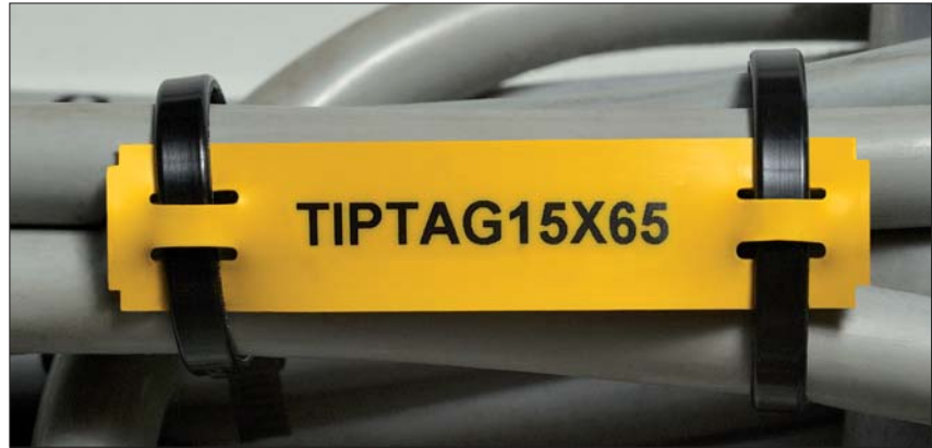
Printable Marking Tag TIPTAG.

TIPTAGs are presented in a special perforated format which includes fastening slots for cable ties. They are especially suited for marking larger cable diameters. Other lengths are available on request.