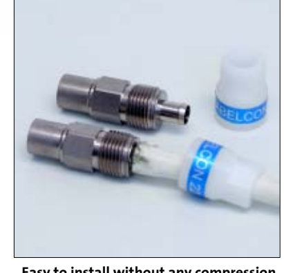
Easy to install without any compression tools