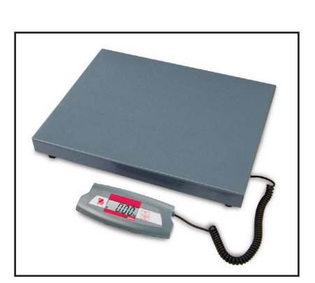
75kg and 200kg models available with large platform