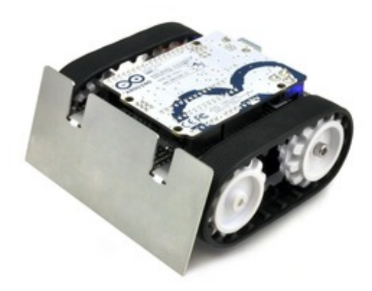
Assembled Zumo robot with a Zumo Shield, Arduino Uno, and Zumo blade.

With the Zumo Shield and an Arduino, the Zumo chassis becomes a low-profile, Arduino-controlled tracked robot that is less than 10 cm on each side (small enough to qualify for Mini-Sumo competitions). It works with a variety of micro metal gearmotors to allow for a customizable combination of torque and speed, and a stainless steel sumo blade is available for applications that involve pushing around other objects. Arduino libraries and sample sketches are available for quickly getting a Zumo robot up and running.