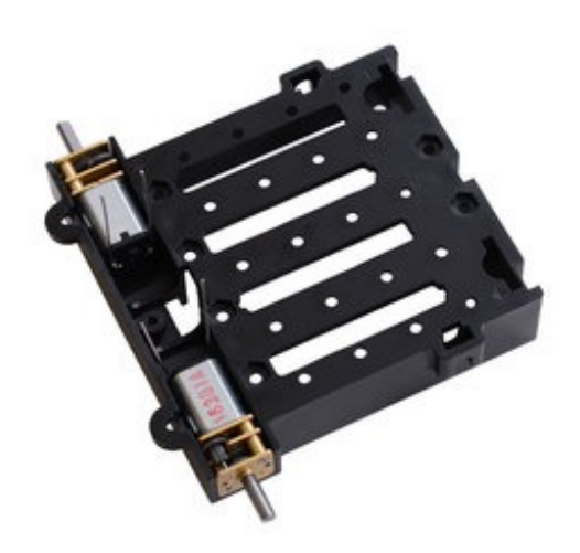
Zumo chassis being assembled with two micro metal gearmotors.

The Zumo Shield ships with all of the components required for shield assembly, as shown in the main product picture. Note that soldering is required; please see the user's guide for detailed assembly instructions. This shield does not include motors or the Zumo chassis itself, though it is available as part of a Zumo Robot kit for Arduino that includes everything you need to build your Zumo robot except motors, an Arduino, and batteries. If you just want a robot that is already put together, we also sell a fully assembled Zumo Robot for Arduino – just add batteries and an Arduino and it is ready to go.