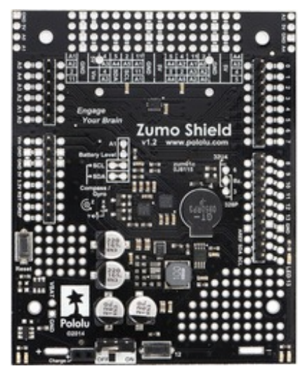
Zumo Shield for Arduino, v1.2, with included through-hole components installed.