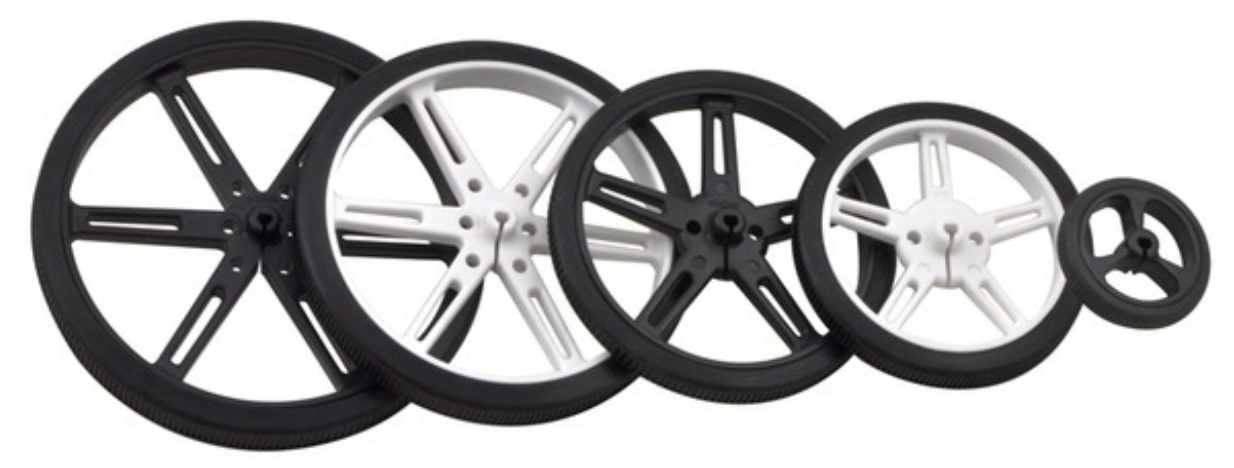
Pololu wheels with 90, 80, 70, 60, and 32mm diameters.

We have similar wheels available in different sizes and colors: