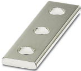
Connection element, Number of positions: 3, Color: silver

Please be informed that the data shown in this PDF Document is generated from our Online Catalog. Please find the complete data in the user's documentation. Our General Terms of Use for Downloads are valid ( http://phoenixcontact.com/download )