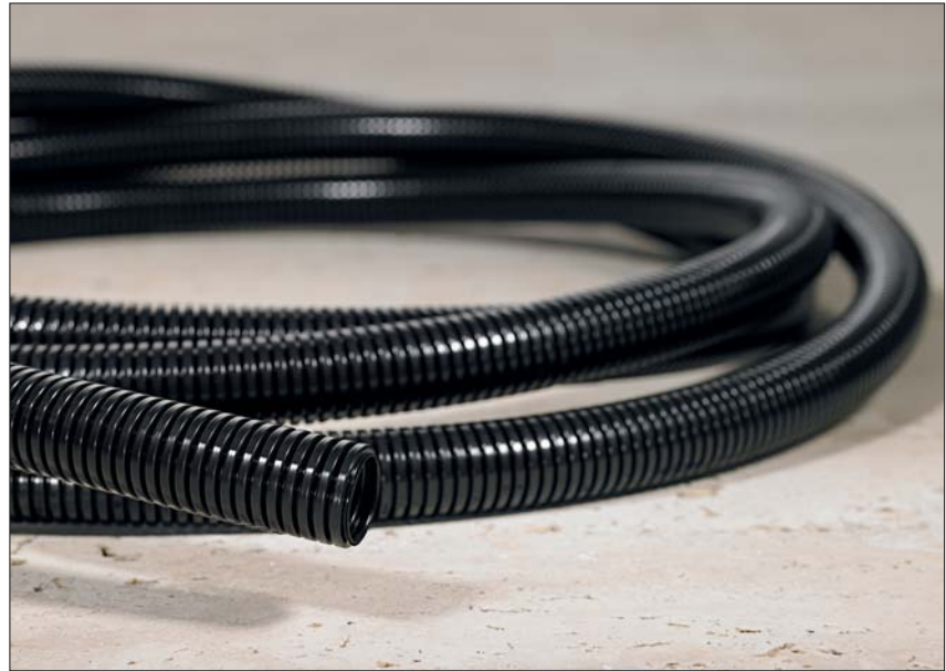
HelaGuard PA6 Light is very flexible and can be used in moving applications.

Machine building, plant construction, control panels and public buildings, wherever lower mechanical protection is required.