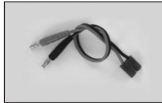
EC3 charging cable 5201-0034-01