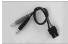
TRAXXAS charging cable 5201-0033-01