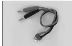
Dean charging cable 5201-0012-01