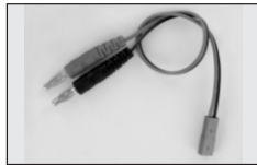
JST/BEC charging cable 5201-0043-01