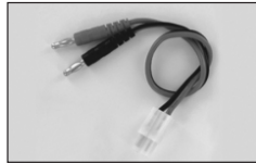
Tamiya charging cable 5201-0030-01