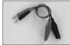
Crocodile clip charging cable 5201-0031-01