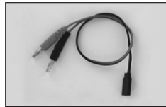
Futaba RX charging cable 5201-0044-01