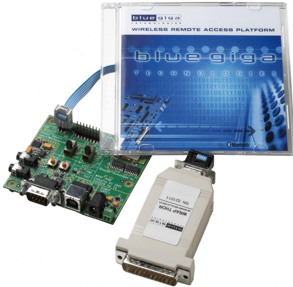
Figure 1: WT12 Evaluation Kit, Onboard Installation Kit and CD