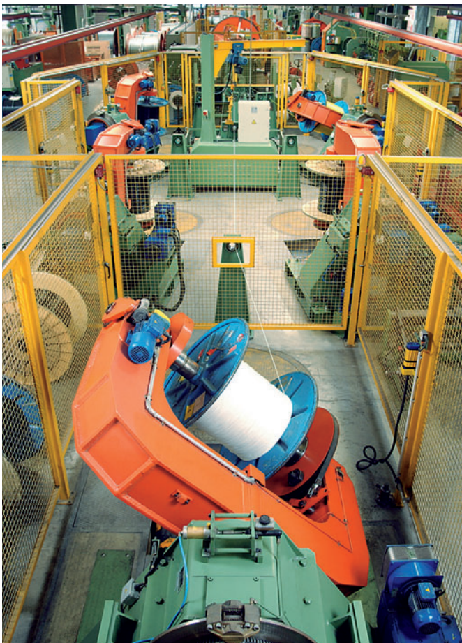
Large cabling machine with backtwist at our Windsbach factory.