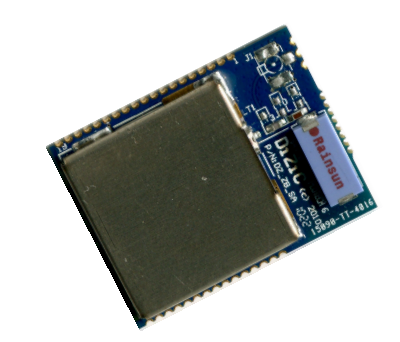
STM32W RF Module Standard version DZ-ZB-SAZ

IEEE 802.15.4 SoC STM32W – The DZ-ZB-S Module uses the fully integrated STM32W System on Chip. This chip includes a 2.4 GHz IEEE 802.15.4 compliant radio, a 32-bit ARM<sup>®</sup> Cortex<sup>™</sup>-M3 microprocessor, Flash and RAM memory, and peripherals of use to designers of ZigBee-based systems.