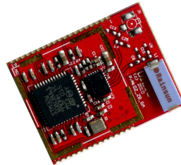
STM32W RF Module Standard version DZ-ZB-GA

IEEE 802.15.4 SoC STM32W – The DZ-ZB-G Module uses the fully integrated STM32W System on Chip. This chip includes a 2.4 GHz IEEE 802.15.4 compliant radio, a 32-bit ARM® Cortex™-M3 microprocessor, Flash and RAM memory, and peripherals of use to designers of ZigBee-based systems.