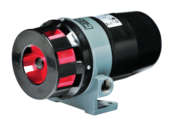
Applications - General safety warning; conveyors; process control alarm; vehicle alarm