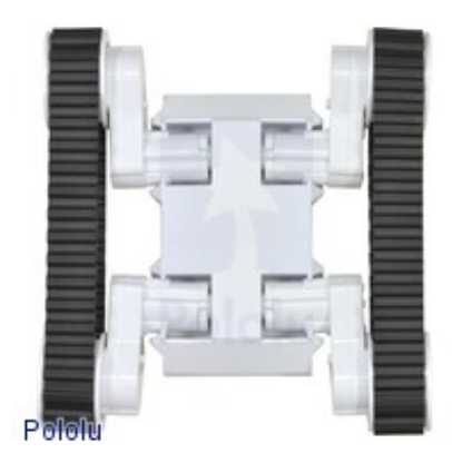
Dagu Rover 5 tracked chassis, bottom view, showing adjustable gearbox assemblies.