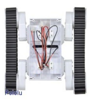
Dagu Rover 5 tracked chassis, top view.