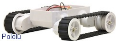
Dagu Rover 5 tracked chassis configured in its default, flattened position.