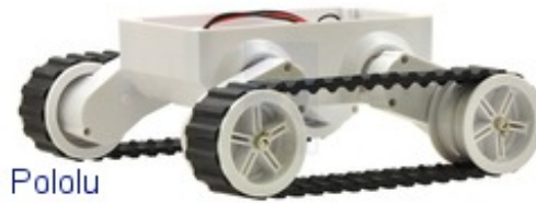
Dagu Rover 5 chassis configured in its maximally elevated position.

The outer dimensions of the chassis are approximately 9.5" long, 9" wide, and 3" tall in its default, flattened configuration (with the front and rear gearboxes mounted at an angle of 180° to each other).