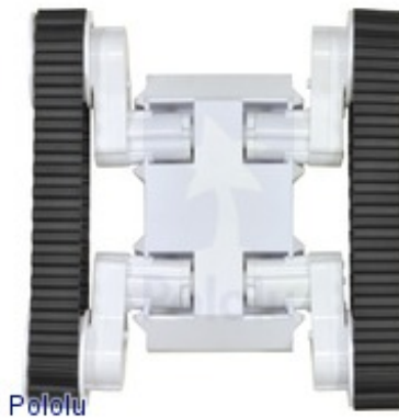
Dagu Rover 5 tracked chassis, bottom view, showing adjustable gearbox assemblies.