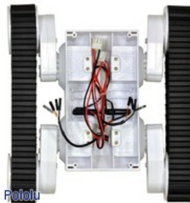
Dagu Rover 5 tracked chassis with encoders, top view.

The Rover 5 tracked chassis, made by Dagu Electronics, is a durable robot platform with caterpillar treads that let it drive over many types of surfaces and uneven terrain. All you need to get the chassis moving is a robot controller or motor controller to drive the two built-in DC motors, which are powered by the included 6-AA battery holder (AA batteries sold separately). A small Phillips screwdriver and an Allen wrench are included for working with the chassis.