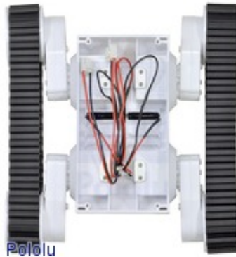
Dagu Rover 5 tracked chassis, top view.