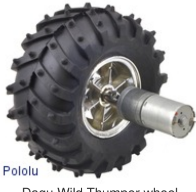
Dagu Wild Thumper wheel 120×60mm (chrome) with Pololu 25D mm metal gearmotor.

Side view of Dagu Wild Thumper 6WD chassis (black version).