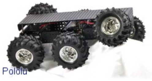
Dagu Wild Thumper 6WD all-terrain chassis, black with chrome-colored hubs.