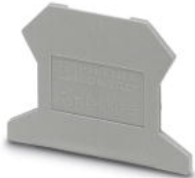
End cover, Length: 42.5 mm, Width: 1.5 mm, Height: 30.7 mm, Color: gray

Please be informed that the data shown in this PDF Document is generated from our Online Catalog. Please find the complete data in the user's documentation. Our General Terms of Use for Downloads are valid ( http://phoenixcontact.com/download )