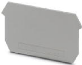
End cover, Length: 63.5 mm, Width: 1.5 mm, Color: gray

Please be informed that the data shown in this PDF Document is generated from our Online Catalog. Please find the complete data in the user's documentation. Our General Terms of Use for Downloads are valid ( http://phoenixcontact.com/download )