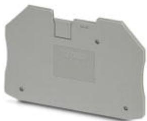
End cover, Length: 65 mm, Width: 2.2 mm, Height: 50.4 mm, Color: gray

Please be informed that the data shown in this PDF Document is generated from our Online Catalog. Please find the complete data in the user's documentation. Our General Terms of Use for Downloads are valid ( http://phoenixcontact.com/download )