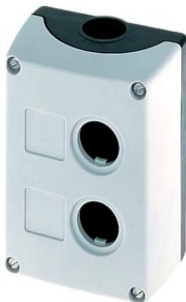
ENCLOSURE FOR 22MM PROGRAM PLASTIC VERSION 2 COMMAND POSITIONS GRAY TOP PART