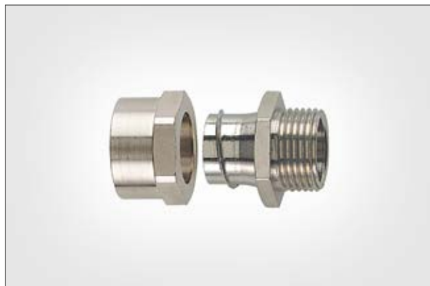
HelaGuard SCSB-FM Fixed External Thread.